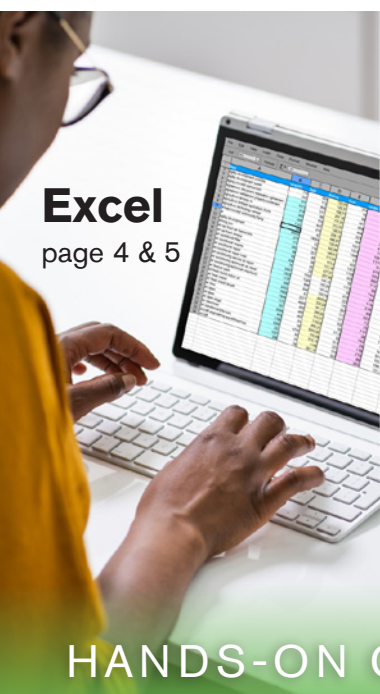
Excel page 4 & 5