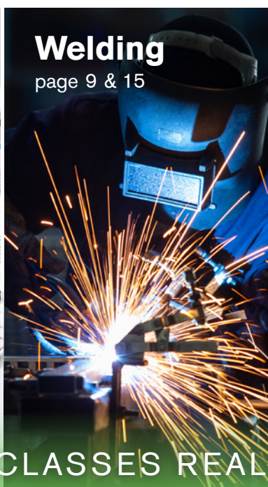
Welding page 9 & 15