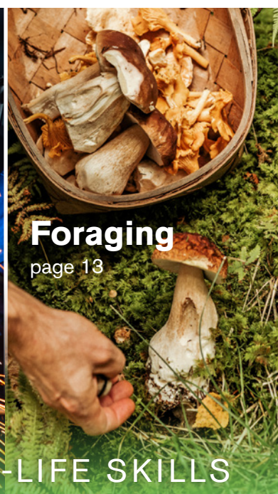
Foraging page 13