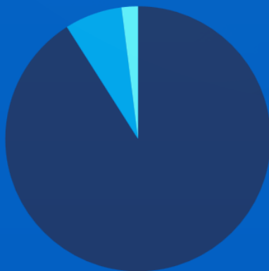
Average Dual Enrollment Credits Earned by Type

■ Dual Credit ■ Start College Now ■ Contract Courses