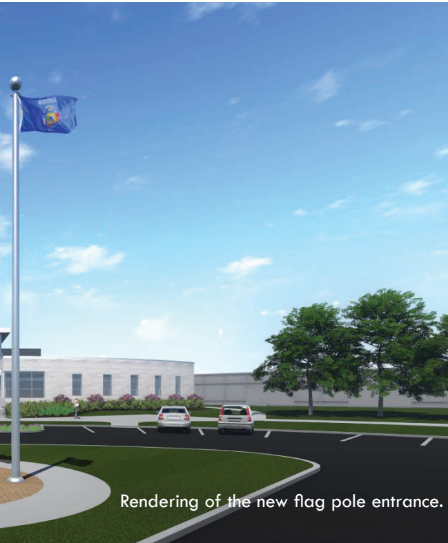
Rendering of the new flag pole entrance.