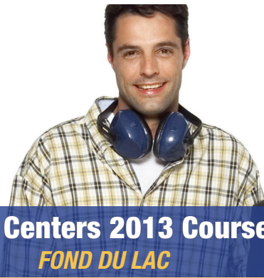
FOND DU LAC