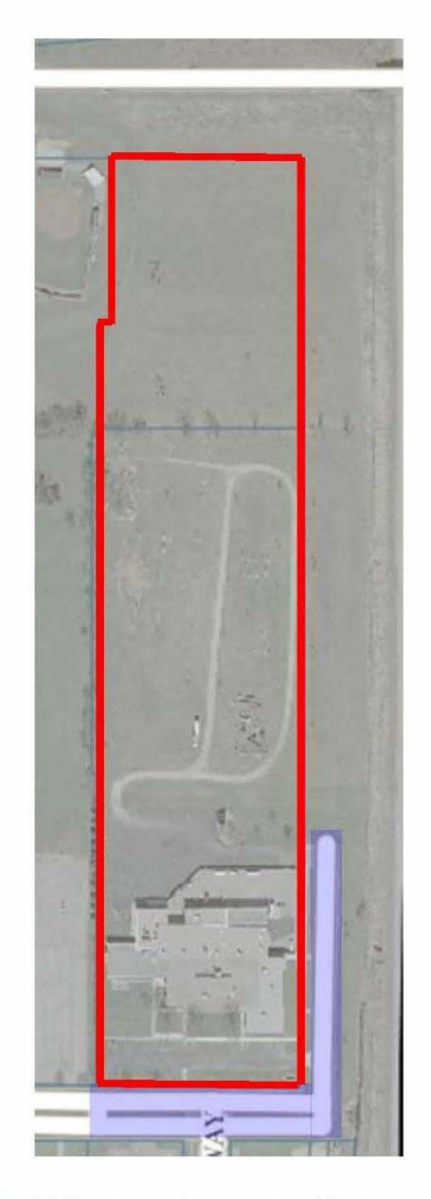
700 Gould Street & adjoining MPTC property to the North Public Property